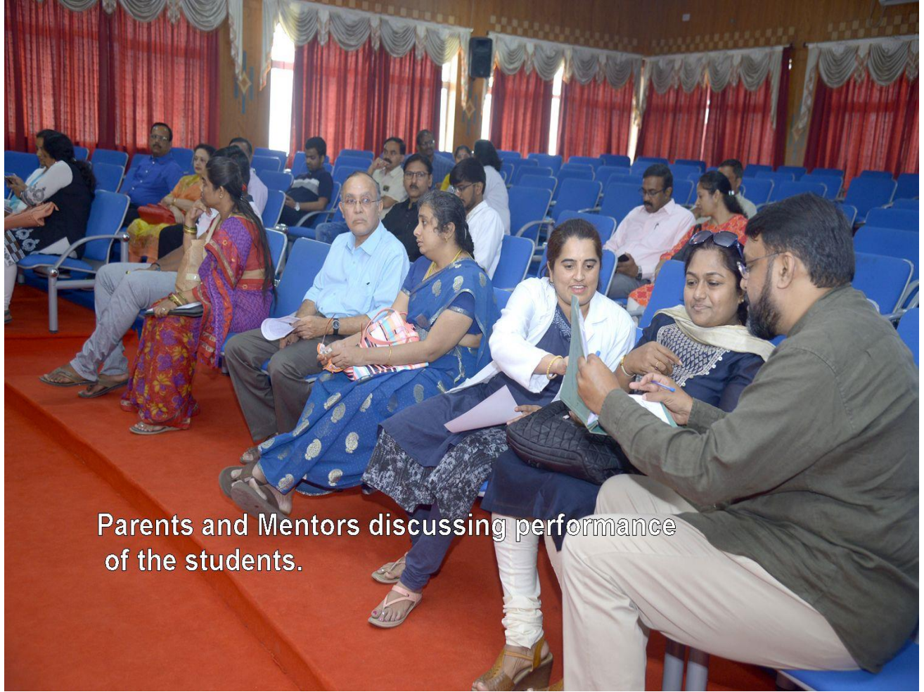
Parents and Mentors discussing performance of the students.