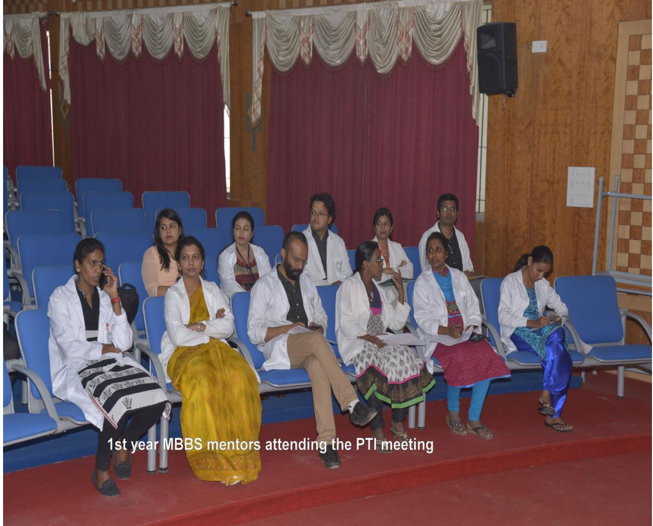
1st year MBBS mentors attending the PTI meeting